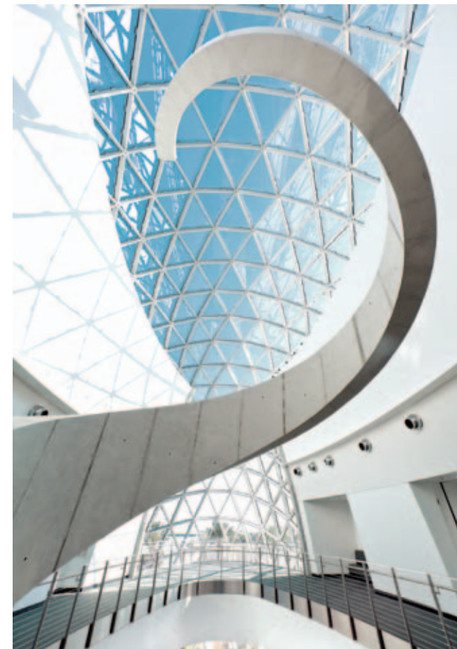
— Qatar National Convention Centre, Qatar Architects: Yamasaki Architects / RHWL, Burns & McDonnell / Veregy DORMA solutions: door closer systems, automatic doors, glass sliding wall systems, moveable walls