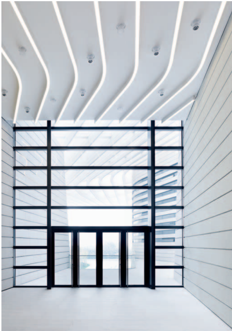
Qingdao Grand Theatre, Qingdao, China Architects: von Gerkan, Marg und Partner DORMA solutions: door closer systems, door and glass fittings, automatic sliding doors

DORMA IS THE TRUSTED GLOBAL PARTNER FOR PREMIUM ACCESS SOLUTIONS AND SERVICES ENABLING BETTER BUILDINGS.