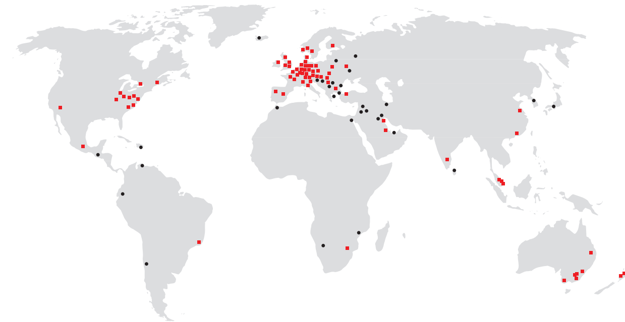
■ DORMA affiliated companies ● DORMA representations

A family-owned company with over 100 years of tradition, DORMA is a world market leader in the fields of door control, movable walls and glass fittings and accessories. In the auto-matics segment too, the company is a member of the world elite. We are likewise successful in the fields of security systems and time and access control, and are Germany's number one in emergency exit and control technology. We maintain major production facilities in Europe, Singapore, Asia, China, and North and South America.