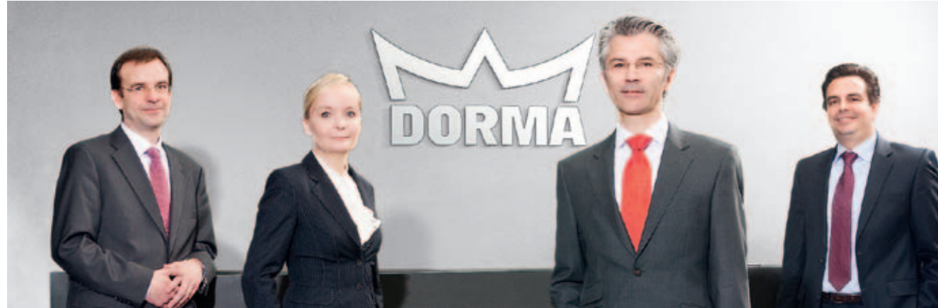
Executive Board of the DORMA Group (from left to right)